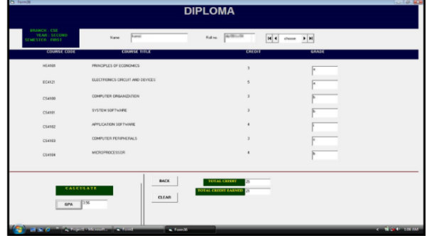
Fig. 6. Calculated GPA with lower-case grades and "i' grade in one subject (CS4102 Application Software ).

Referring the calculation of GPA in block diagram (figure 1) and the grade and grade points in Table I, the GPA for the entries in figure 5 will equal to (3*5+5*4+3*0+3*3+4*4+3*4+4*4) / 25 = 88/25 = 3.52 which is same as the generated value by our system (figure 5).