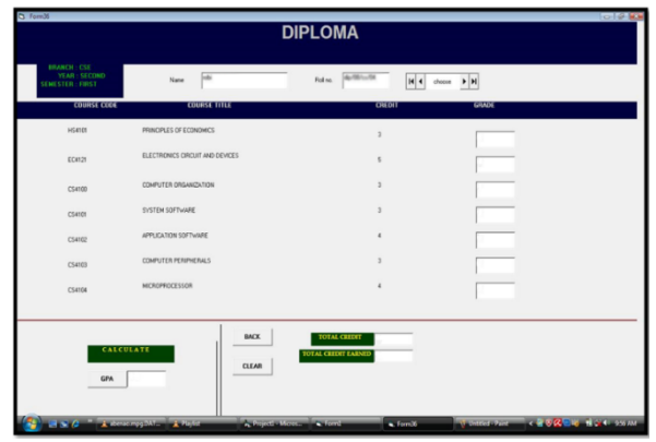
Fig. 3. GUI to enter the obtained grades

The figure 3 shows the course code, course title, and credits for CS branch, Second Year, First Semester. For example, CS4100 is the course code for the subject E . Computer Organization and carries 3 credit. Similarly, in The 5<sup>th</sup> row, CS4102 is the course code for Application • Software which carries 4 credit and so on. Text boxes are provided to enter the grades. The different grade letters and grade points are tabulated in Table I. The letters are made to be case in-sensitive i.e., one can enter ' A ' or ' a ', • both will carry same grade point i.e., ' 5 '.